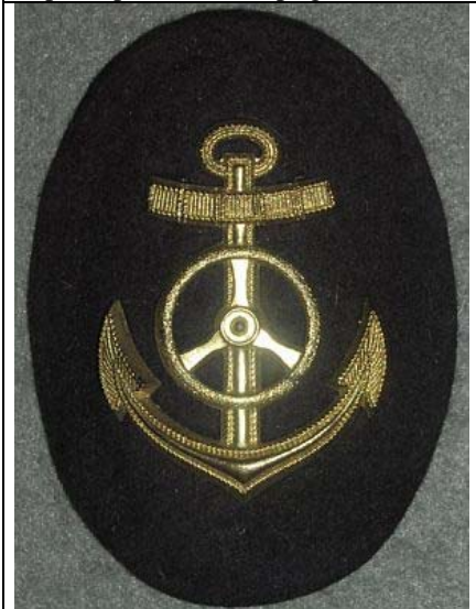
Kraftfahrmaat Motor Transport Petty Officer 3rd Class.