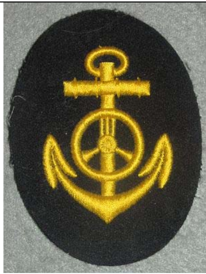
Standard machine embroidered patch.