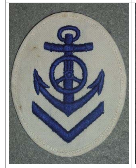
Machine-embroidered for the white jumper..