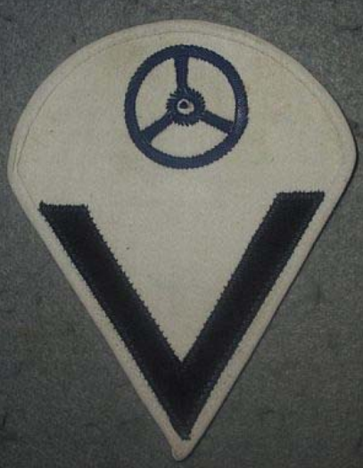
Kraftfahrergefreiter (Seaman 3rd Class) Hand-embroidered wheel, cloth chevron.