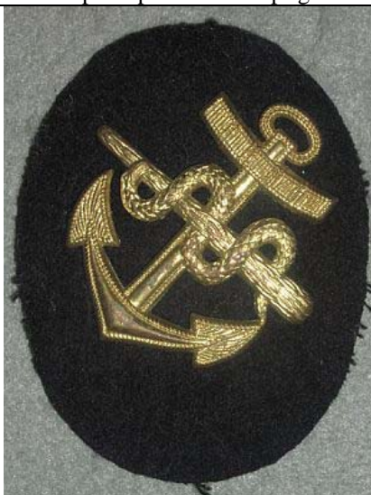
Sanitätsmaat Petty Officer 3rd Class.

The insignia for Medical Personnel was a snake entwined on a staff . For petty officers the wing & lightning bolts were superimposed on an upright anchor, with the anchor and staff both tolted at 45^{\circ} angles.