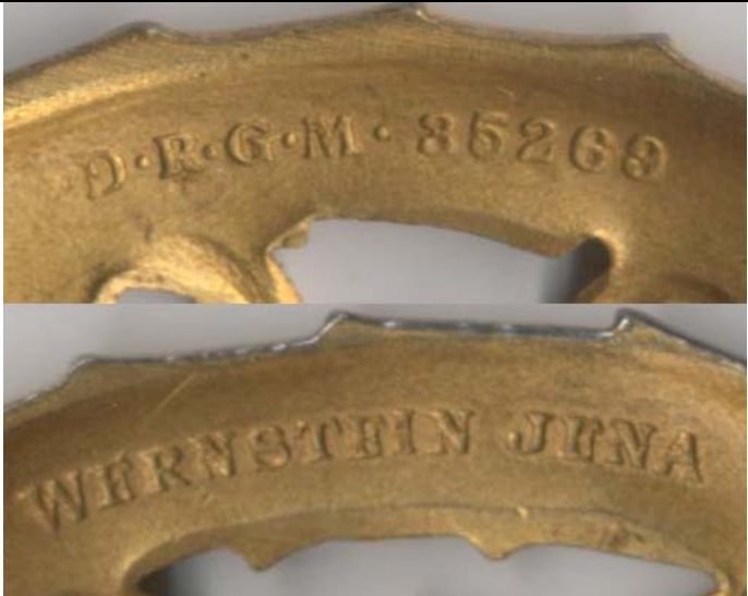
Prepared by Darrell Simpson - September 2005