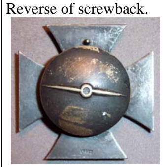
Prepared by G.Stimson - July 2005