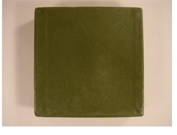
Prepared by Jacques – September 2005